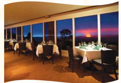
VOLCANO HOUSE RESTAURANT

Terms and conditions: Tax and gratuity not included. One Day Tours are taxed 4.712%, no cancellations or refunds on airline and land tour portion of combo. Tour prices and features are seasonal, time permitting and subject to change without notice. Gray Line Hawaii/Polynesian Adventure Tours, LLC will not be liable for any injury, loss, damage, or accident to person or property of any individual on the tour from any cause beyond its control. H2 Volcano Land Tour - we do not guarantee viewing of lava due to external factors outside our control. Covered, walking shoes are recommended. This tour is not recommended for people with asthma or respiratory conditions that may be exacerbated due to exposure to volcanic fumes. PUC #974C | Blue Hawaiian Circle of Fire Tour: Per FAA requirements, passengers that are 2 years of age are required to have their own seat. People who have gone scuba diving must wait 24 hours before going on this tour. Flight times and routes are subject to change due to weather, maintenance and passenger counts. In the event of helicopter tour cancellation for any reason, guests will be accommodated as described in "Flight safety is our top priority" section above. Mobile tablet devices are not allowed as they may impede the view of others. Go-Pros are welcomed on board as hand-held devices (no accessories/attachment handles).